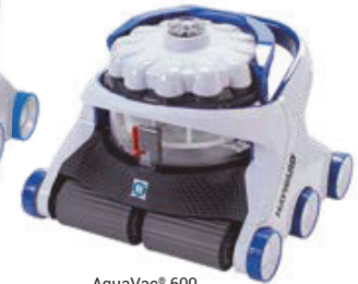
AquaVac® 600 Foam version