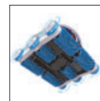
Brushes version: for liner, PVC, fibreglass, concrete pools