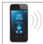
WiFi app with AV650 for iPhone®, iPad® and Android devices