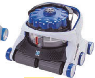
AquaVac® 650 Foam version