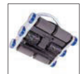
Foam version: for tiled, mosaic and stainless steel pools