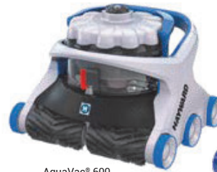
AquaVac® 600 Brushes version