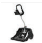
Caddy cart included