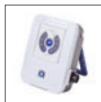
Light and easy to use power supply