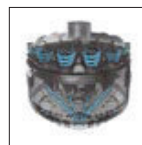
«SpinTech™» a constant suction power