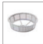
Supplied with its separation filter RCX361511243