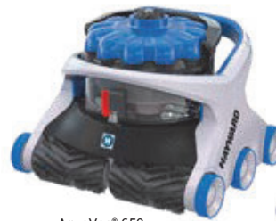
AquaVac® 650 Brushes version