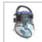
«TouchFree™» innovative debris cannister