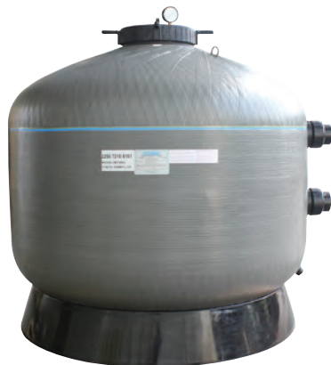
SMD Lockring lid version (SMD600, SMD750)