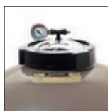
180 mm diameter threaded opening for simpler maintenance operations