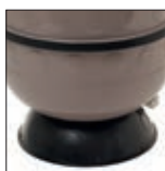
Circular base for perfect filter stability