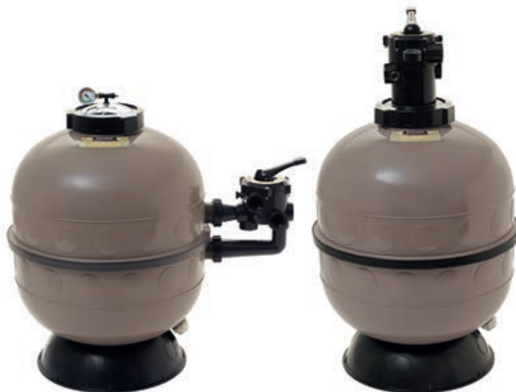
ProSeries™ HI Side